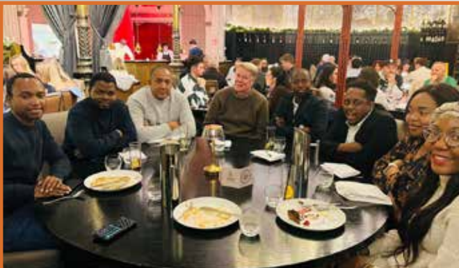
Ireland Chapter Christmas Lunch at Fire Steakhouse, Dublin