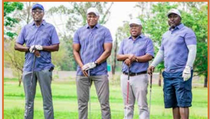
Bulawayo Members Year End Golf Day