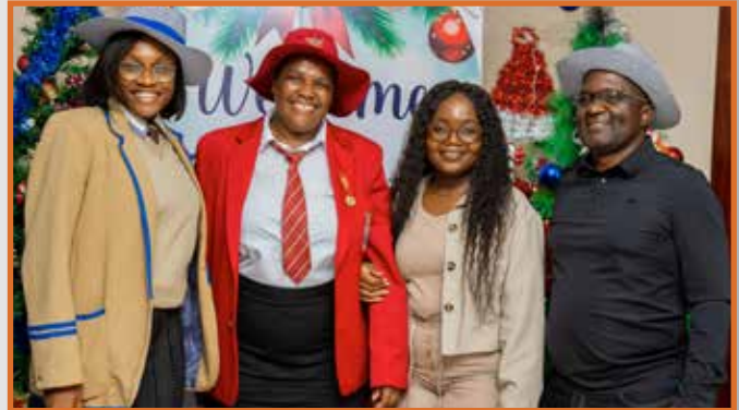
Mashonaland Year End Members Event in High School Theme, Back where it all began