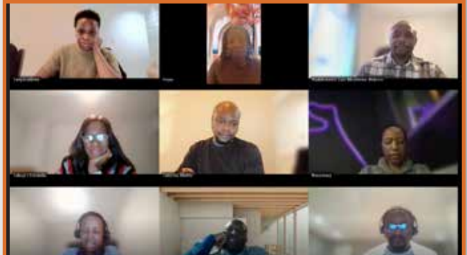
Canadian Chapter Virtual Social & Financial Wellness Year End Event