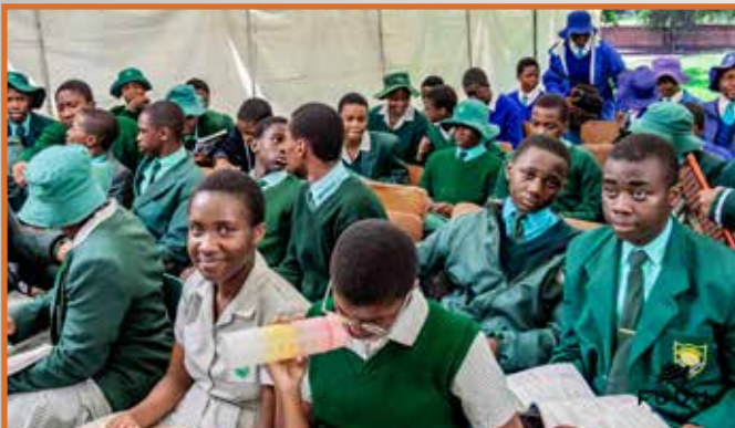
Matabeleland High Schools Career Guidance