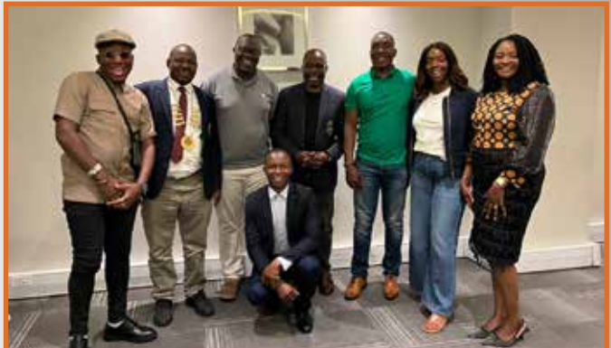
Namibia Chapter Year End Event with the President