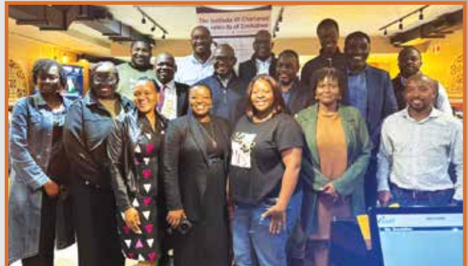
South Africa Members Year End Event