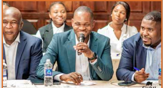
Bulawayo Students Year Event