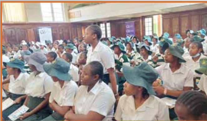
Manicaland High School Career Guidance