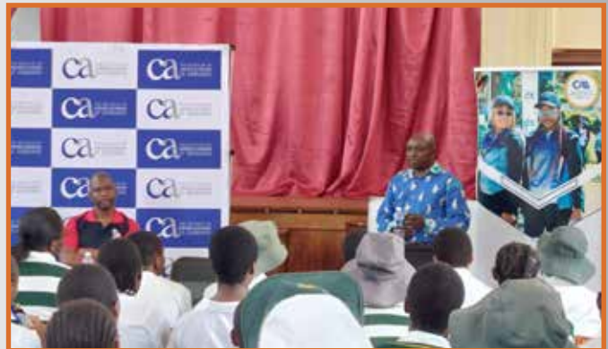
Manicaland High School Career Guidance