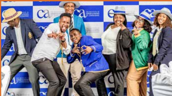
Matabeleland Year End Members Event in High School Theme, Back where it all began