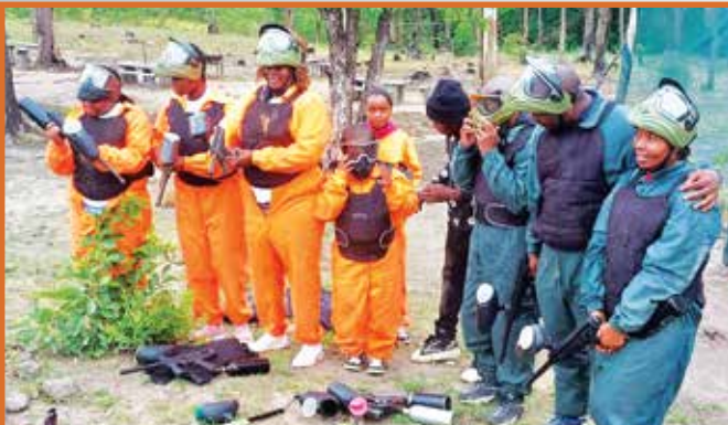
Manicaland Family Fun Day