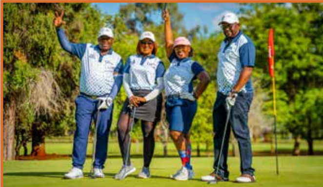
Harare Members Year End Golf Day