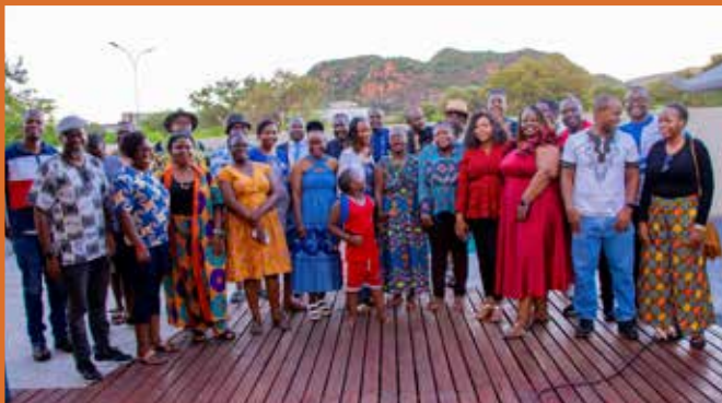
Botswana Chapter Year End Members Event at Lily's House Gaborone