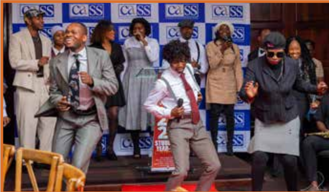
Harare Students Year End on Old School Theme

ICAZ wrapped up the year with dynamic engagements across our chapters and student communities. In November and December, members from Mashonaland, Matabeleland, Manicaland, Botswana, South Africa, and Namibia came together for year-end events celebrating achievements and strengthening connections. Mashonaland and Matabeleland chapters also hosted gold tournaments, where members enjoyed a round of golf before joining the celebrations. Our Chartered Accountants Student Society marked the year with memorable gatherings for students in Mashonaland and Matabeleland, nurturing the next generation of accounting professionals.