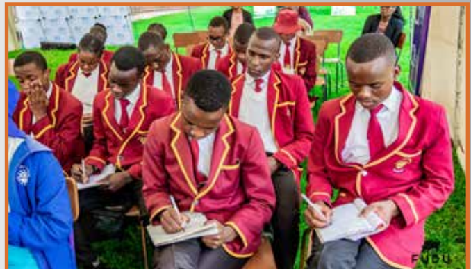
Matabeleland High Schools Career Guidance