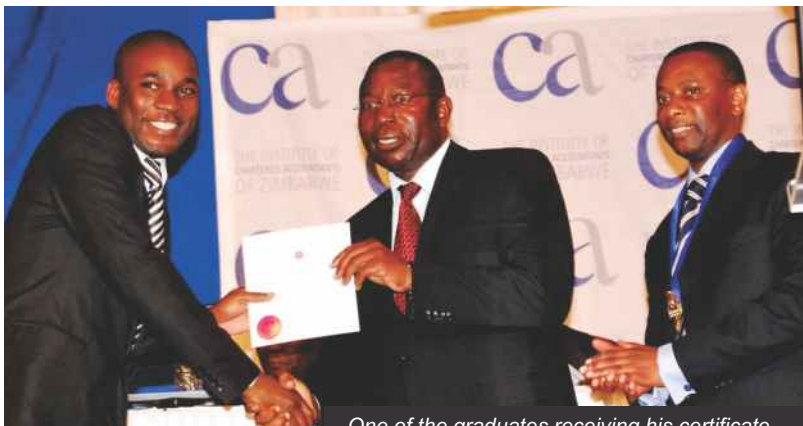
One of the graduates receiving his certificate...

Minister Mangoma said accounting was one of the best qualifications due to the norms and values it possesses and was one of the greatest assets any country should invest in "Chartered accountancy is a pre-eminent and the best qualification one can have as it gives a lot of ground on how to conduct yourself in a manner that shows you are full of ethics. We are capable of dreaming things we want to be as long as we realise that the greatest asset of any country is its people and all countries that have done it have invested in their