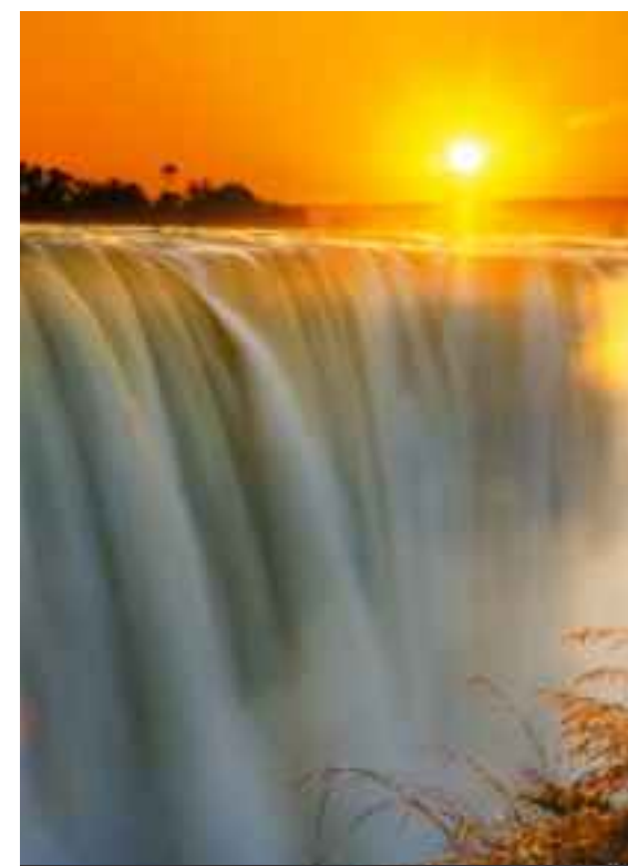
The mighty Victoria Falls, venue for the 2012 Winter School

Victoria Falls is slowly turning into a "permanent" venue for the Winter School due to the increase in numbers of delegates.